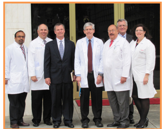
The NCMS Board of Directors attend the first White Coat Wednesday of 2013

Summary: Filed in response to House Bill 181, this bill would eliminate the current requirement for physician supervision of CRNAs. It was not debated during the 2013 session and is ineligible for consideration in 2014.