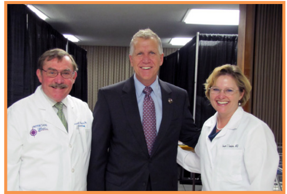
Speaker of the House Thom Tillis joins the NC Dermatology Association at NCGA Skin Cancer Screening Event.